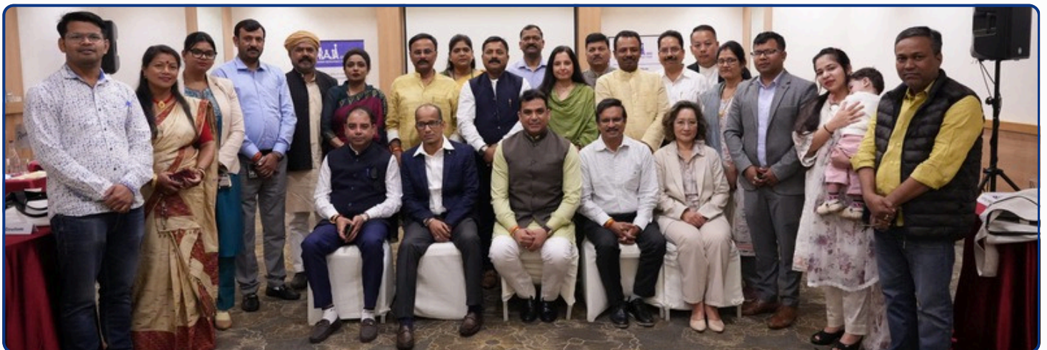
Leadership Programme | Cohort 1

Praja Foundation launched the Leadership Programme on 29th January 2026, a first-of-its-kind initiative designed to bring together Urban Leaders through structured, experiential learning, advisory support, and long-term engagement . The programme will build the capacity of Urban Leaders to make informed decisions , implement innovative solutions , and co-create resilient, inclusive cities that address the needs of their citizens. The programme brought together 24 urban leaders from 11 cities across 5 states and Delhi NCT , creating a diverse cohort representing varied institutional, political, and regional contexts.