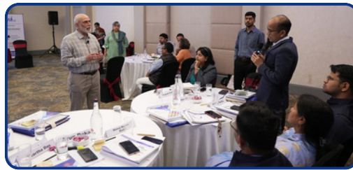
Interaction with the participants