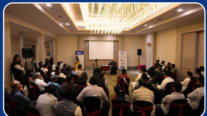
Fireside chat with the participants