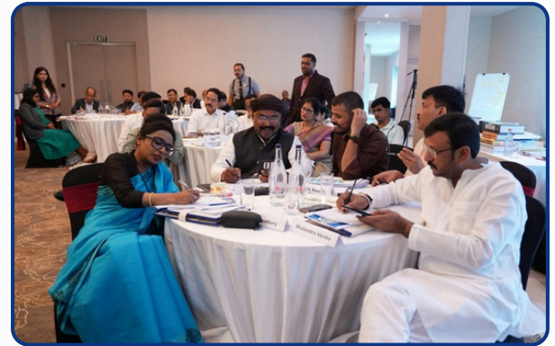
Urban Leaders actively participating in the knowledge sessions